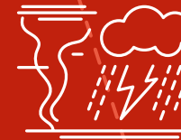
Extreme weather events