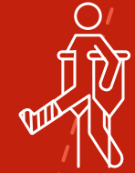
Employee personal injury