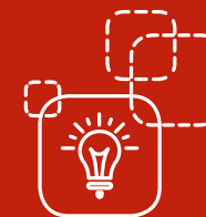
Contingent project liabilities